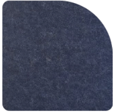
36 French cotton 12mm thick 2820mm x 1220mm