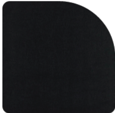
87 Carbon Black 12mm thick 2820mm x 1220mm