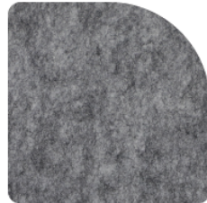
70 River Rock 12mm thick 2820mm x 1220mm