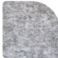
58 Pompeii Marble 9mm thick 2820mm x 1220mm

Creating quiet with sustainable materials.