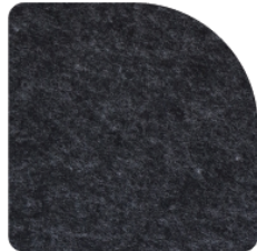
50 Nordic Stone 12mm thick 2820mm x 1220mm