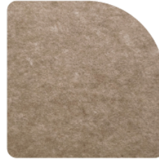
61 Texel Sand 12mm thick 2820mm x 1220mm