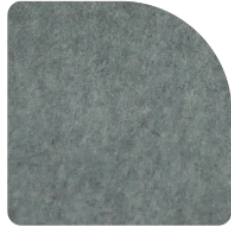
22 Iberian Eucalyptus 12mm thick 2820mm x 1220mm