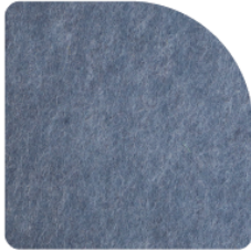
32 Delta Blue 12mm thick 2820mm x 1220mm