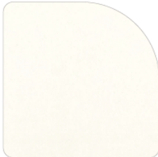
99 Ice White 12mm thick 2820mm x 1220mm