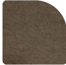
60 Dutch Pebble 12mm thick 2820mm x 1220mm