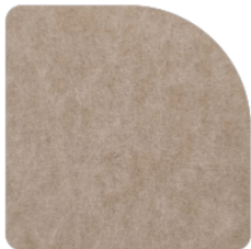
57 French Wool 9mm thick 2820mm x 1220mm