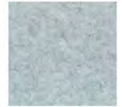
Marble Arch 211-12