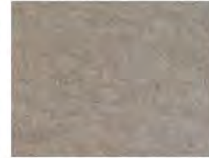
61 TEXEL SAND