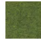
Primrose Hill 222-12