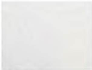
99 ICE WHITE