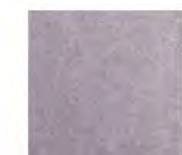
Holland Park 441-12