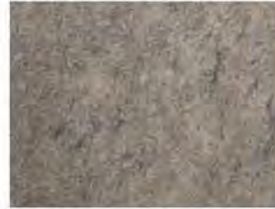
60 DUTCH PEBBLE