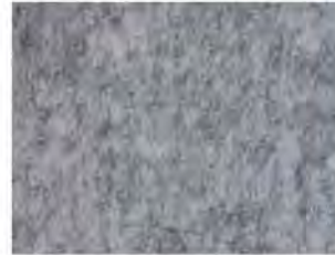
70 RIVER ROCK