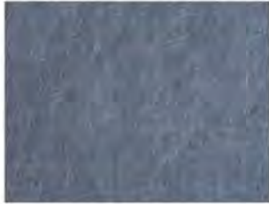
32 DELTA BLUE