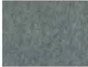
22 IBERIAN EUCALYPTUS