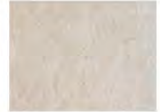
57 FRENCH WOOL