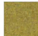
St Giles 230-12