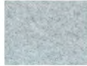
58 POMPEII MARBLE