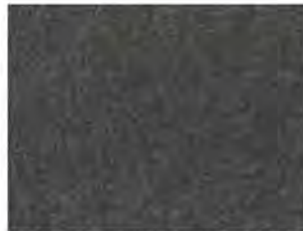
50 NORDIC STONE