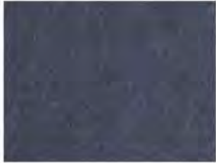
36 FRENCH COTTON

*Please note the colours are photographic representations and would advise seeing a sample of the actual colour.