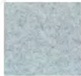
Marble Arch 211-09