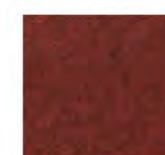
Kings Cross 227-12